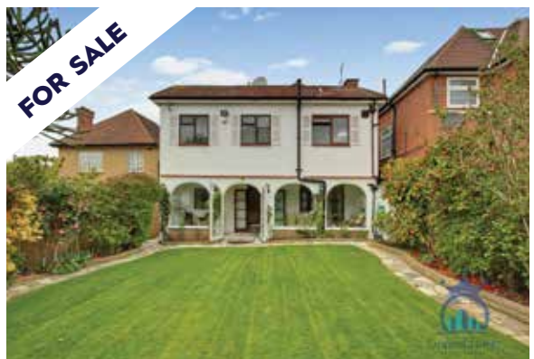
Salmon Street, Kingsbury