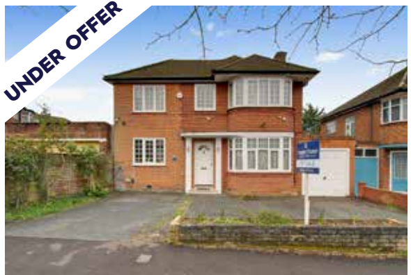
Wemborough Road, Stanmore