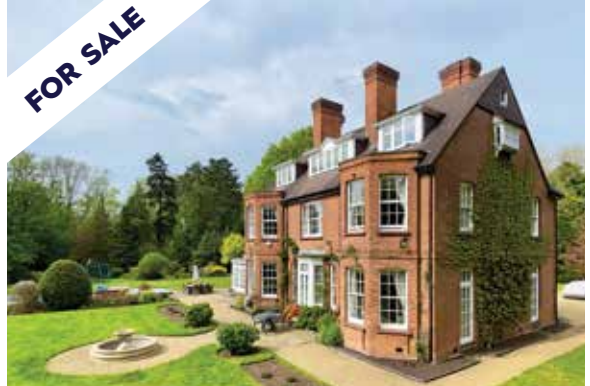
Mount Park Estate, Harrow