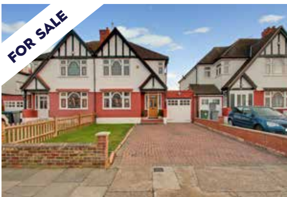
Norval Road, Wembley