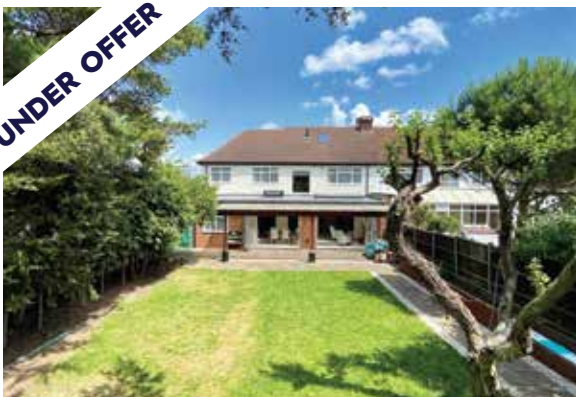
Upton Gardens, Kenton, Harrow